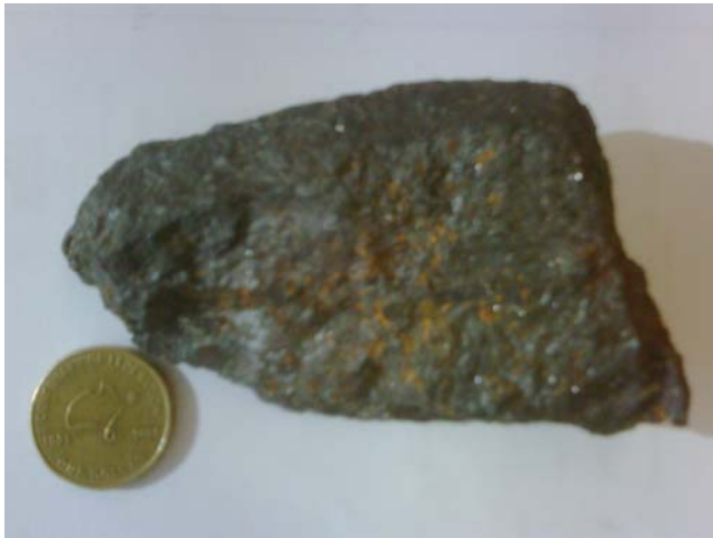
Iron sample collected at the Hicks Prospect gravity anomaly

Copper Range completed negotiations with Joint Venture partner Flinders Mines Limited (Flinders) to acquire 100% of Metal Rights of the Caltowie tenement (EL 4368). This was achieved by the transfer of Flinders' entire interest of EL 4368 to Copper Range in exchange for Copper Range transferring its entire interest in a number of other tenements to Flinders