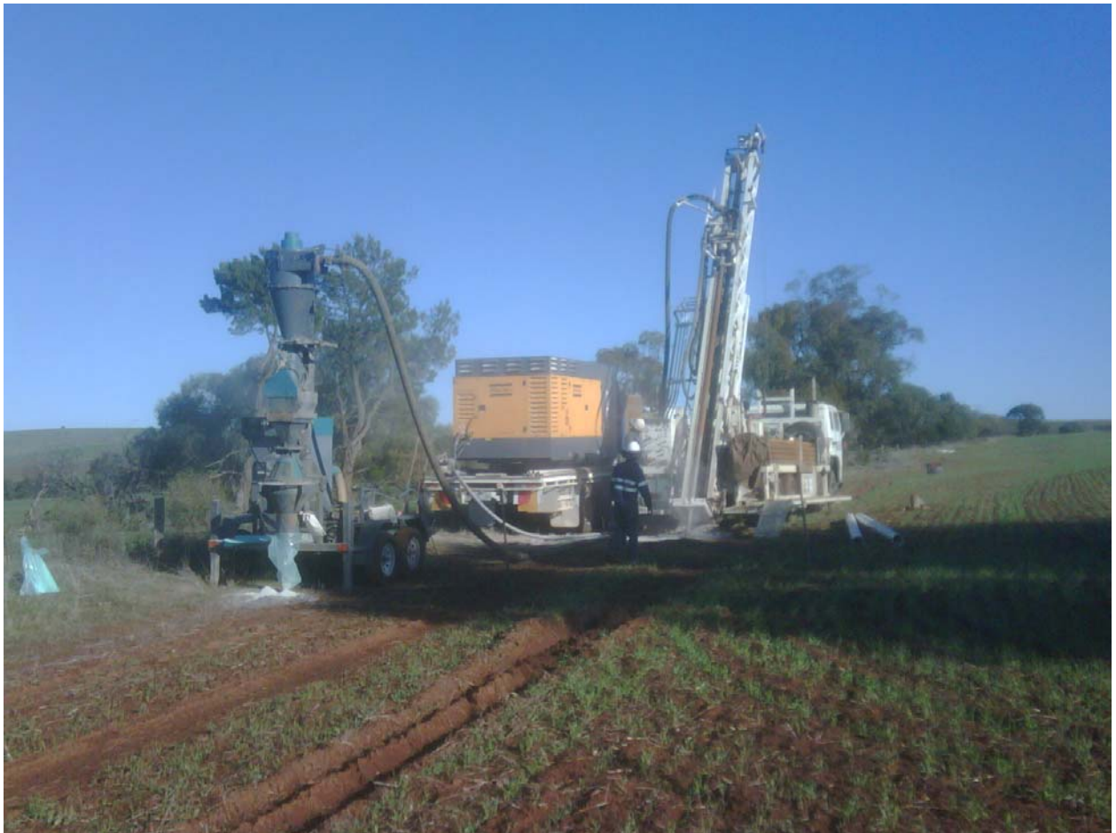
Commencement of RC Drilling at the Hicks Prospect